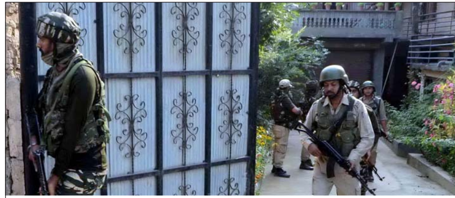
Security personnel conducting door to door search after an encounter at Deyarwani area of Batmaloo in Srinagar on Sunday in which one policeman was killed and four others injured.