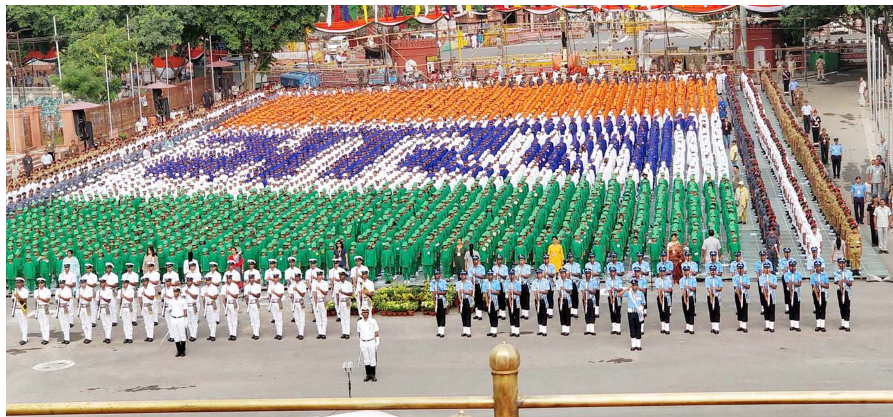
NCC cadets formed the script 'Bharat' during the first full dress rehearsal for the Independence Day Celebrations - 2018 at Red Fort, in Delhi .

On overseas visits, Prince Mohammed has dwelt on his plan to improve women's rights and strengthen the economy. He is also obliquely critical of the guardianship laws, saying they did not exist in Saudi Arabia before 1979 - the year of the Iranian revolution and the siege of the Grand Mosque at Mecca. But despite this rhetoric on rights, the palace has shown little tolerance of political criticism at home. Since May, many women's rights activists have been detained. In addition, dozens of lawyers, human rights defenders and intellectual have been arrested since September 2017. Interestingly, while most Western Governments refrain from commenting on the crackdown against dissent in Saudi Arabia, Canada has given refuge to Mr Badawi's wife and children. For Canada, the spat could prove costly. Saudi Arabia is its second largest export destination in West Asia. The two countries have signed a $12 billion arms deal, which is still in the works. But despite the aggressive Saudi response, Ottawa had stood by its Foreign Minister, saying it will continue to back "the protection of human rights, including women's rights". For Prince Mohammed, the diplomatic crisis is an opportunity to rethink the Kingdom's approach towards dissent and diplomacy. If he is indeed serious about reform, Riyadh should be lenient towards its advocates. Taking vengeful action against those who stand by rights activists will neither help Saudi Arabia's image nor attractive statement into the country.