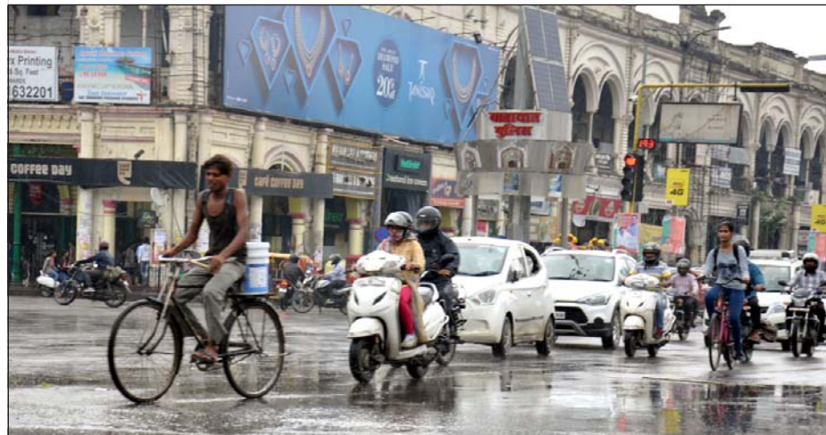
People passing in monsoon rain in Lucknow.